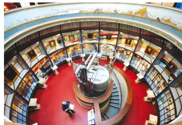
Explore the Rotunda

Scarborough Collections is the name used for everything that Scarborough Museums Trust does inside Woodend Creative Workspace. This includes family fun days, museum store tours, lecture series, workshops and opportunities for researchers to work with the collections.