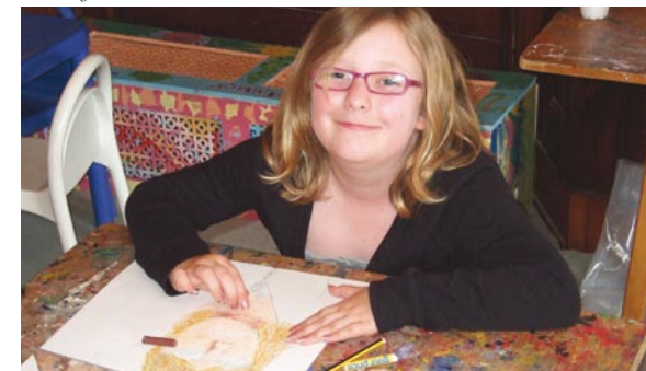
Saturday Art Club