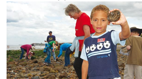
Dinosaur Coast Fossil Hunt

No booking required. Meet on the slipway to the beach at Sandsend. Grid Reference TQ265765.