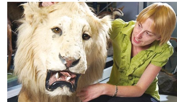
Tour Scarborough Collections

Making Gristhorpe Man Talk Tues 16 Mar 6.30 – 7.30pm 14+ - Talk